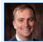
Matt Vickers (Con)