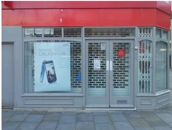
Above: Security grilles within the shop front