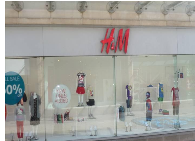
Above: Example of a modern shop frontage within a shopping centre

5.24 Modern and contemporary designs can also be incorporated into more traditional buildings are still make positive contributions to the street scene. These designs will often involve careful consideration of a number of factors. Experience has shown that typically these types of design have involved a more interpretation of traditional shop front design