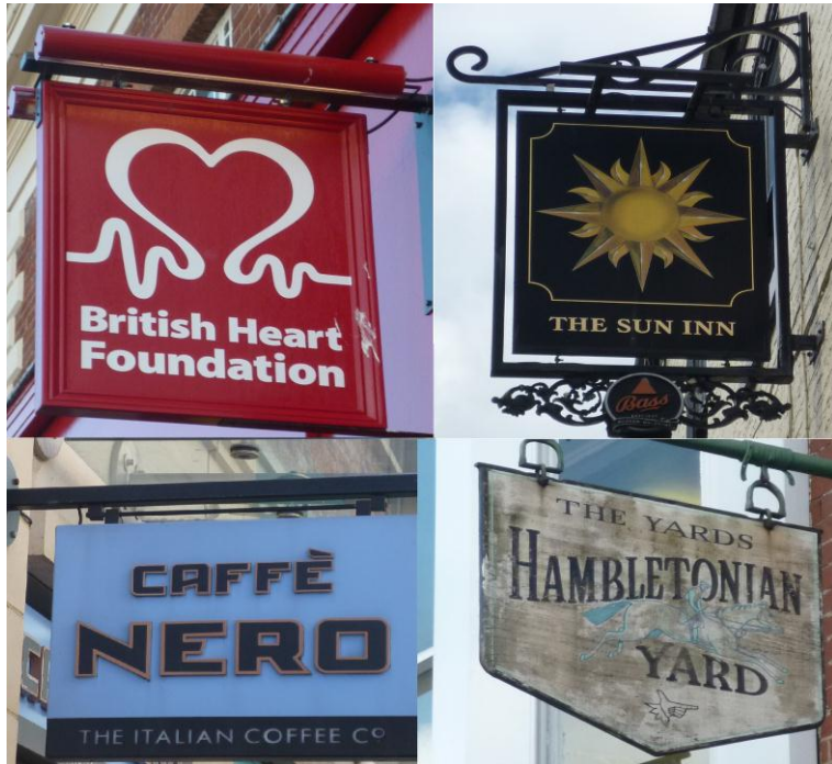
Variety of approaches to types of hanging signage

enhance the character of the building and street. The style of any supporting brackets should also reflect the character of the building.