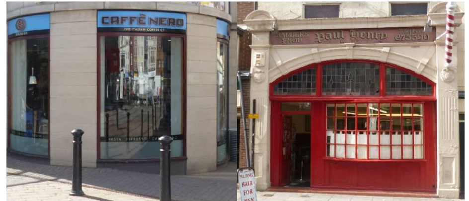
Above: Examples of both modern and traditional approaches to shop frontages