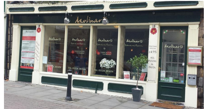
Above: Subtle advertisements displayed as part of the shop frontage/window display