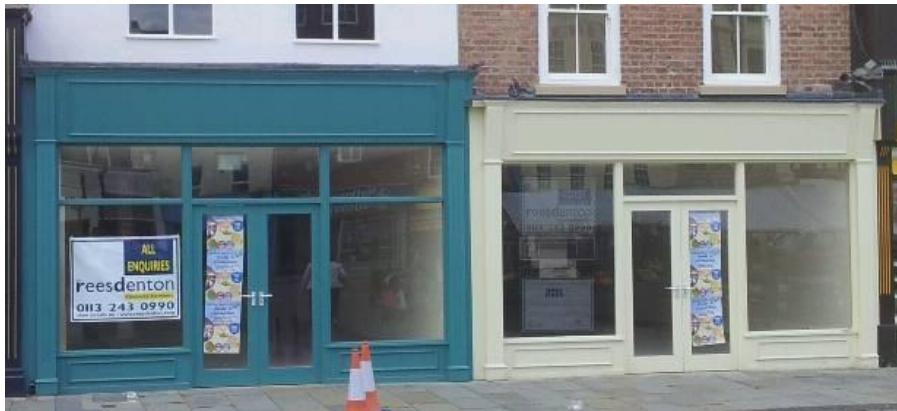
Above: Newly created traditional styled shop frontages