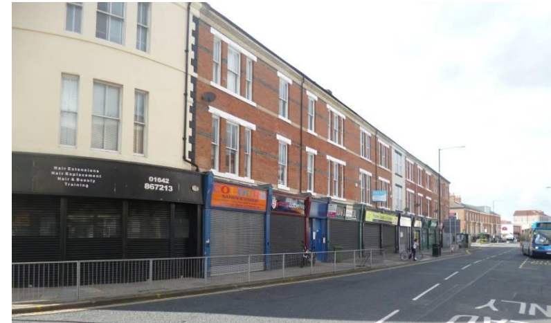
Above: The negative visual impact of external roller shutters

6.1 Crime and the fear of both crime and anti-social behaviour have created a high demand for security measures within shop frontages. It is recognised that many shopkeepers and businesses wish to install security measures to protect both their premise and stock. The use of security measures should be considered as part of the initial design stage of any new shop front. They should ensure that they do not detract from the vibrancy of the street scene and where possible enhance it. The following section sets out a number of options to consider;