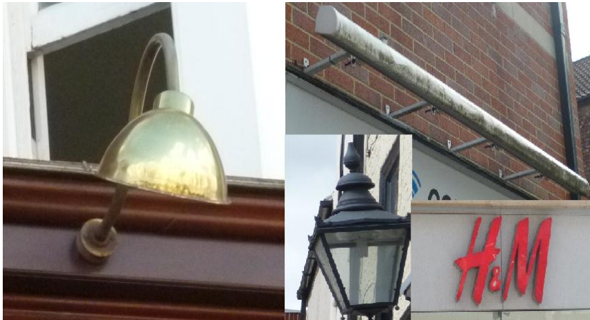
Above: Alternatives to internal illumination