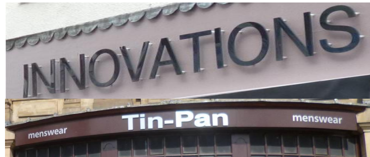
Above: Individual Lettering upon shop frontages

7.12 Large lettering can often dominate the building and advertisement. Equally large flat fascia panels are not always as successful as those that create some depth through the use of projecting letters or otherwise. Within conservation areas and listed buildings the use of individual lettering will be strongly encouraged and where a building is of considerable significance this may be insisted upon. Again alternative approaches to the typical corporate image may be required.