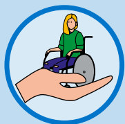
Adult Social Care and Health