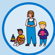
Children and Young People