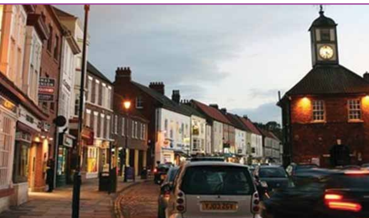
Yarm High Street