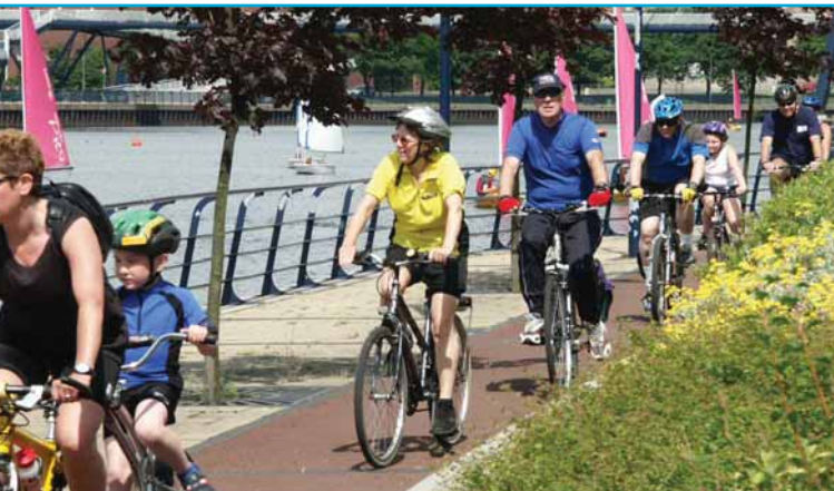
Cycling on the Riverside