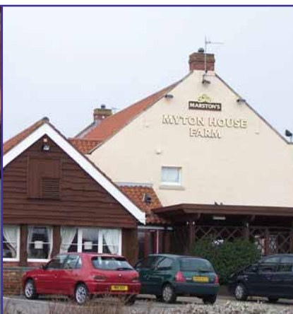
Myton House Farm