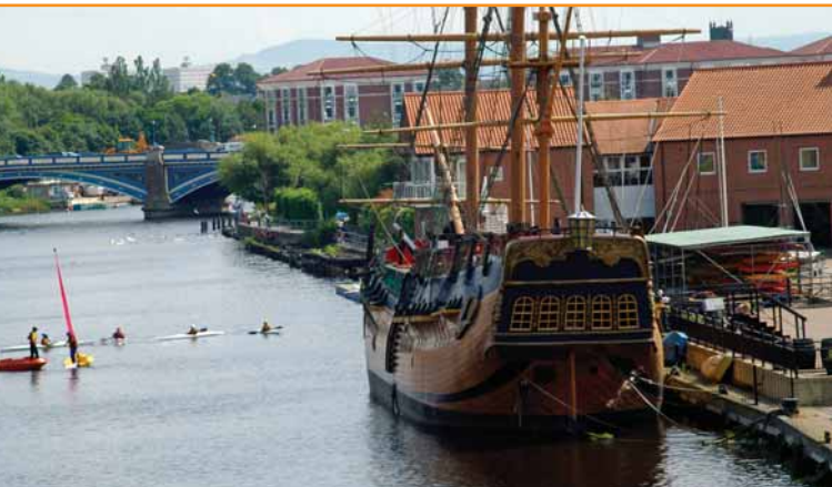
HM Bark Endeavour