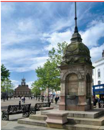
Stockton Town Hall and Cenotaph

High Street, Yarm, Stockton-on-Tees TS15 9AH