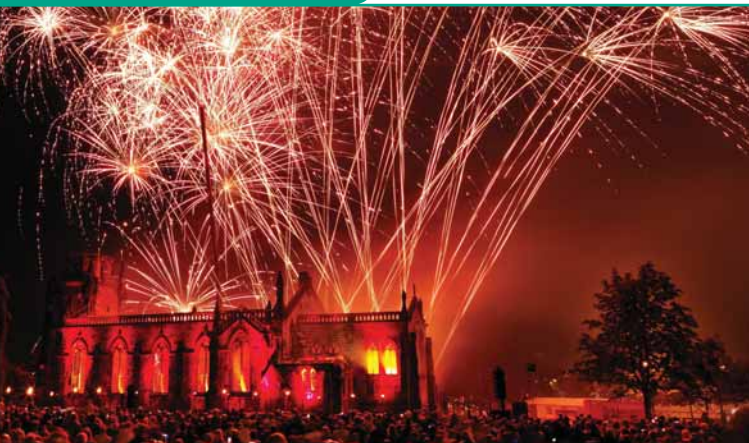
Fireworks at Trinity Gardens* SIRF Finalé

It's happening in Stockton. From Festivals and Fairgrounds to Specialist Markets and other shopping events, there's something for everyone.