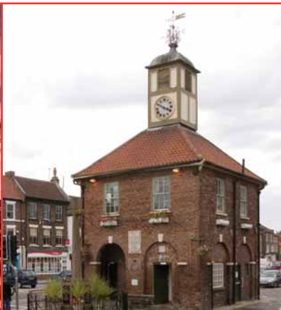
Yarm Town Hall