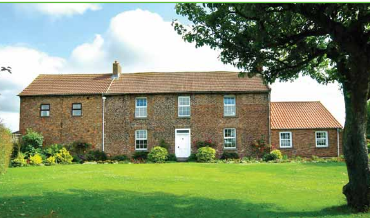
Todd House Farm