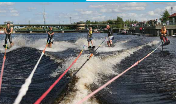
Water Skiing at Tees Barrage

We offer a broad and diverse range of activities for all ages and abilities from water-based sports such as white water rafting and canoeing to ice-skating and racing.