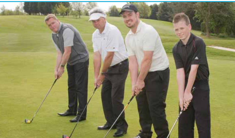
Infinity Golf Challenge