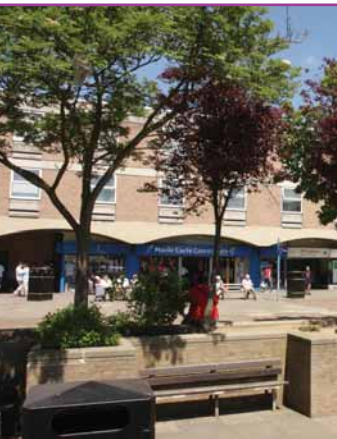
Billingham Town Centre