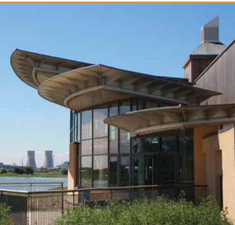
Saltholme Wildlife Reserve and Discovery Park

Website: www.rspb.org.uk/reserves/guide/s/saltholme