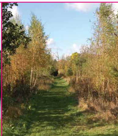
Tees Heritage Park