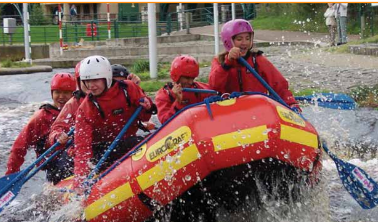
Rafting on the River Tees