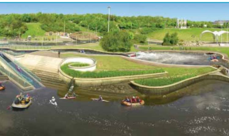
Artist Impression - Tees Barrage International White Water Course