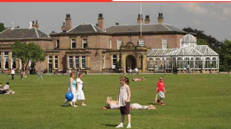
Preston Hall Museum

Discover the history and heritage of Stockton-on-Tees, from memorable medieval churches to the natural beauty of the Teesdale Way. There are huge opportunities for visitors to explore the boroughs heritage.