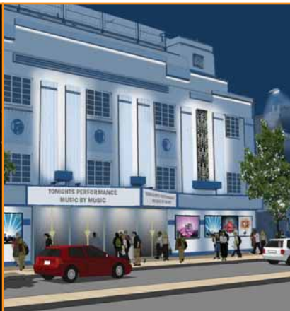
Artist Impression - The Globe Theatre