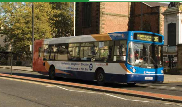
Stockton Town Centre

With an excellent transport network, Stockton has never been easier to reach.