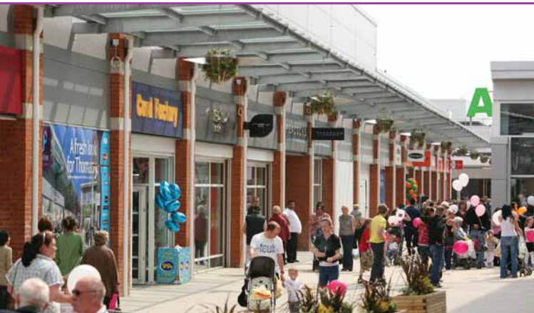
Thornaby Town Centre