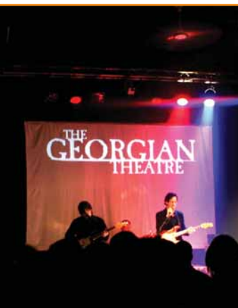
The Georgian Theatre*