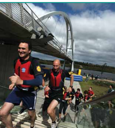
The River Rat Race