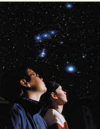
Wynyard Woodland Park Planetarium & Observatory