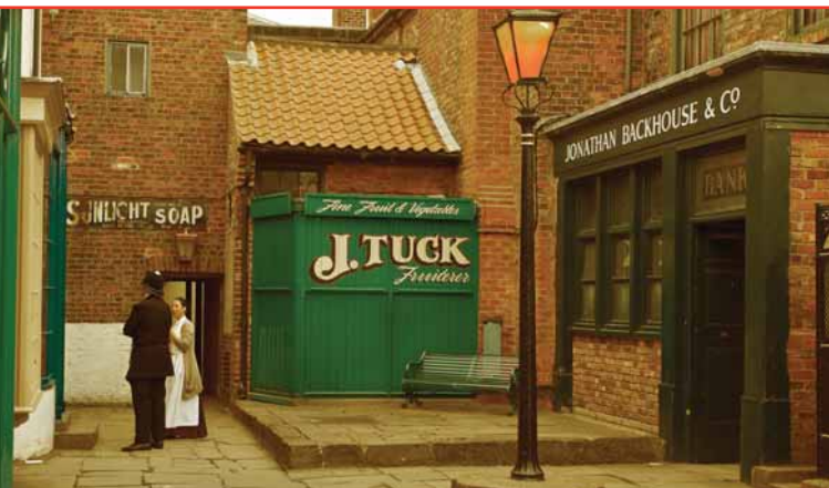
Preston Hall Museum