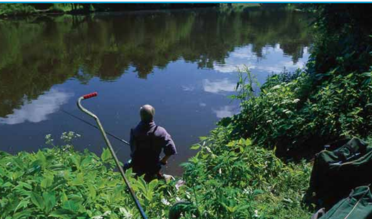
Fishing, River Tees

* 'Billingham Forum'