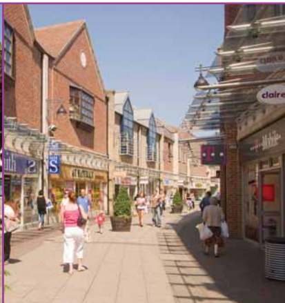
Wellington Square Shopping Centre