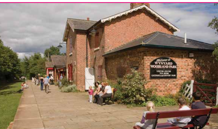
Wynyard Woodland Park