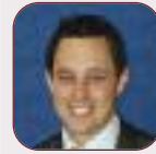
Ben Houchen (Con)