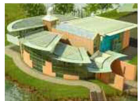
Artist's impression of Saltholme Visitor Centre

Altogether, the European Regional Development Funds, One NorthEast and the Tees Valley Partnership are funding more than £800,000 for road improvements associated with the Saltholme Project.