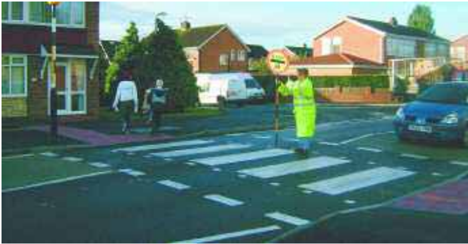
A local funding decision - the new zebra crossing on Darlington Back Lane

For nearly two years, locally based groups have been able to have a direct influence on setting transport priorities for their areas.